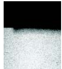
Test Group 3 Glass H/Coke