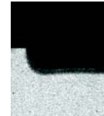
Test Group 2 Orange Juice/Coke