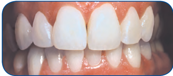
Dramatization: results may vary by patient and by type of stain. * Equivalent to approximately 42% carbamide peroxide.